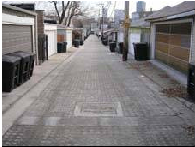
Chicago Green Alley.

requirement acts as an incentive to reduce impervious cover through whatever means work best for the site. For example, a property owner may install permeable pavement if new paved surfaces are desired, or retrofit impermeable paved surfaces with permeable pavement in order to increase building size. The code allows for additional impervious coverage if stormwater is managed such that the infiltration capacity of the site is not diminished and runoff leaving the property does not have negative impacts off site. Because Philadelphia’s impervious coverage regulation does not specify the manner of compliance, it leaves room for flexibility and creative solutions while achieving the desired environmental performance.