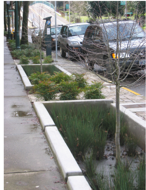
Portland Streetside Infiltration Planters.

Burnsville, Minnesota solved a similar problem of managing road runoff in a slightly different way. Lacking space in the right-of-way to implement bioretention practices, Burnsville launched a one month long public outreach campaign in an effort to get residents involved in the solution. Eighty-five percent of the residents agreed to participate in the rain garden retrofit project and allow the city to build rain gardens on the edge of their property to treat road runoff. The city obtained an $117,000 grant from the Metropolitan Council and contributed $30,000 of the City’s funds to build the rain gardens. Each rain garden cost $7,500: $500 for plants, $8.00/square foot for construction, and $4.50/square foot for education, design and construction supervision. The City has easements to maintain the rain gardens, which have been successful at reducing runoff by 90%. 29